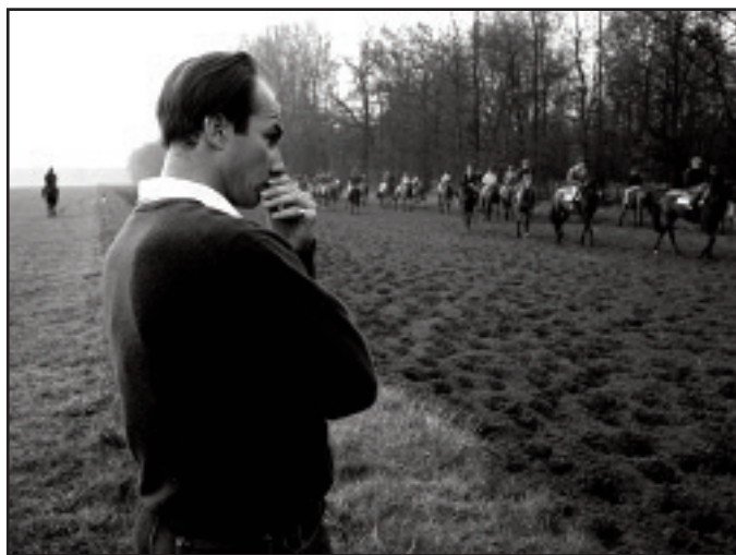
His Highness the Aga Khan watches horses in training at Chantilly in 1963. The picture is taken from Racing and Breeding Tradition: The Horses of the Aga Khan.

This book traces the history of the Aga Khan Studs through remarkable photographs, engravings and paintings taken from the archives of the Aga Khan. A lengthy interview of His Highness the Aga Khan, and